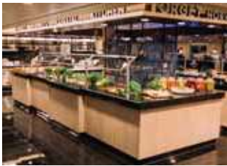
Target main restaurant